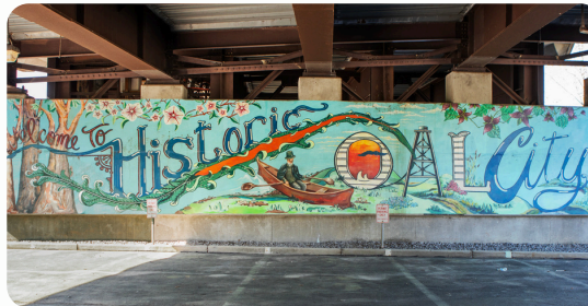
Blue Muse By: Ehren Knapp