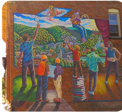
Pennzoil Men By: Oil City Students